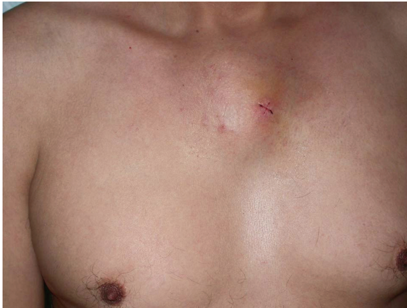
Fig. 1. Shows the sterna mass post true cut biopsy.

lymphadenopathy. The blood work showed normal values apart from high (erythrocyte sedimentation rate ESR) and C reactive protein (CRP). Plain chest (Posteroanterior view) and sternal views X-rays showed no pathology. CT scan of the chest revealed a mass destroying the manubrium, and neither lung pathology nor mediastinal lymphadenopathy was found (Fig. 2). Our provisional diagnosis of primary sternal TB was based on clinical and radiological backgrounds which were confirmed later, microscopically. Our differential diagnosis includes sarcoma of the sternum. True Cut Biopsy was performed and revealed white cheesy discharge. This was sent for Ziehl-Neelsen stain, Lowenstine-Jenhsen medium cultures, Polymerase Chain Reaction (PCR) and cytology. PCR came positive for Mycobacterium TB, and after two weeks, Mycobacterium bacilli were grown in Lowenstine-Jenhsen medium cultures. The patient was started on a four-drug anti TB therapy (Isoniazid, Pyrazinamide, Pyridoxine and Rifampin). The patient was followed up in one to four months; eventually the mass disappeared completely.